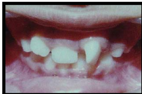
Fig. 1. Intraoral view showing rotation of 21 and unerupted 22

An intraoral periapical radiograph and a maxillary occlusal radiograph revealed an unerupted mesiodens (Figure 2), which was surgically extracted. Thereafter, a Hawley's appliance with a modified labial bow and a palatal hook was designed to derotate the tooth 21 [Figures 3 and