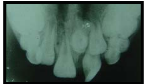
Figure 2. Occlusal view of premaxilla showing the unerupted mesiodens; rotated 21 and unerupted 22

Senior Lecturer, Pedodontics Dr. HSJ Institute of Dental Sciences & Hospital Panjab University Chandigarh (India)