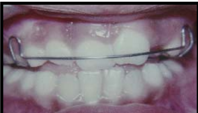
Figure 6. Removable retainer after correction of rotated 21

of force to derotate 21 [Figure 5]. The patient was instructed to change the elastics after every 48 hours and was reviewed periodically. After the correction of rotation, a retainer was placed [Figure 6].