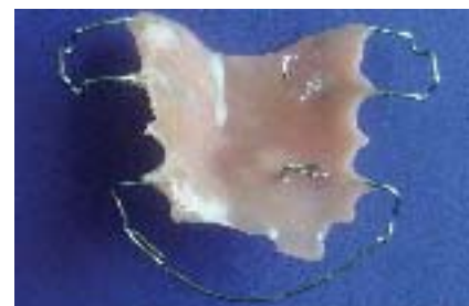
Fig. 3. Hawley's appliance with the embedded palatal hook

An intraoral periapical radiograph and a maxillary occlusal radiograph revealed an unerupted mesiodens (Figure 2), which was surgically extracted. Thereafter, a Hawley's appliance with a modified labial bow and a palatal hook was designed to derotate the tooth 21 [Figures 3 and